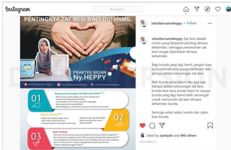
Figure 2 : Example of Educational Content about Rational Use of Supplementation in Pregnancy

The evaluation stage was performed two weeks after the implementation stage, held on Saturday, October 2, 2021, in form of educational content competition, with Youtube Link: https://youtu.be/IZSHlaOCuQs .