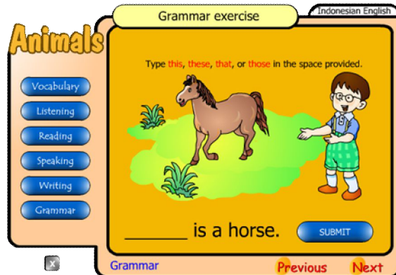
Figure 7. One of the activities in the Grammar part