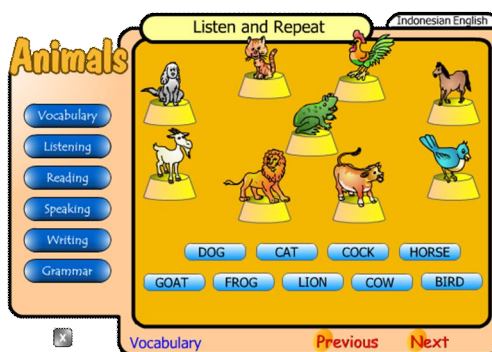
Figure 2. The first page of the Vocabulary part

The instructional content for the theme “Animals” is organized into 6 parts: vocabulary, listening, reading, speaking, writing and grammar (Figure 1). In this lesson, the students are going to learn animal-related words which are presented, first of all, in isolation (specifically in the vocabulary part) and then the words are presented in context (throughout the listening, reading, speaking and writing parts). The language focus is presented in a Grammar part. Basically, each part presents information to learn and an exercise or some exercises to reinforce the students’ understanding of the lesson learned and enhance their language skills. The students’ answers to the exercises are given feedback whether they are true or false. Spoken instructions (in English and Indonesian) are provided in each part of the lesson telling the students what to do.