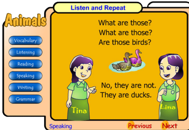
Figure 5. The first page of the Speaking part

Accordingly, the software developed through this study has its design features related to those three levels of multimedia concept. Each level is described below.