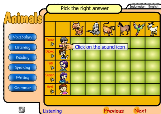
Figure 3. The first page of the Listening part

The six parts of the lesson in this multimedia software are presented in a non-linear mode allowing the students to have a flexible access to the information. In addition, the multimedia software allows interactivity which can be actualized through not only intentional selection of information, but also manipulate and investigate a lesson through active, self-directed exploratory learning (Schnotz, 2001). This can promote cognitive engagement and positively affect learning.