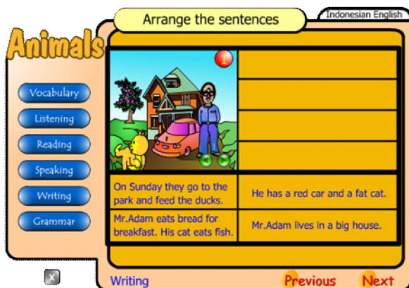
Figure 6. One of the activities in the Writing part