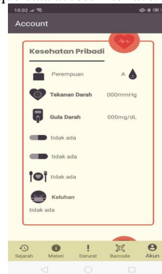
Feature 1. Account at Application dokterkit

Based on the requirement of the chatbot platform, data to be collected and used in this work include physiological information like blood pressure, heart rate, and BMI by measurement at smart mobile phones. Captured data is stored, enriched, then semantically fused to enable a unified and unique data access interface.