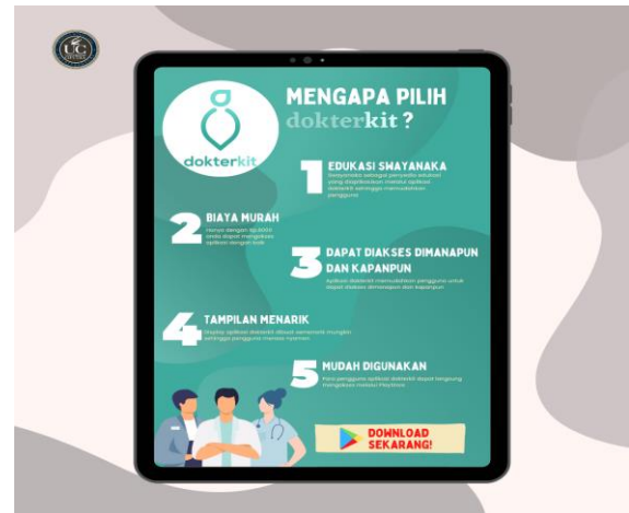
Feature 3. Promotion Application dokterkit